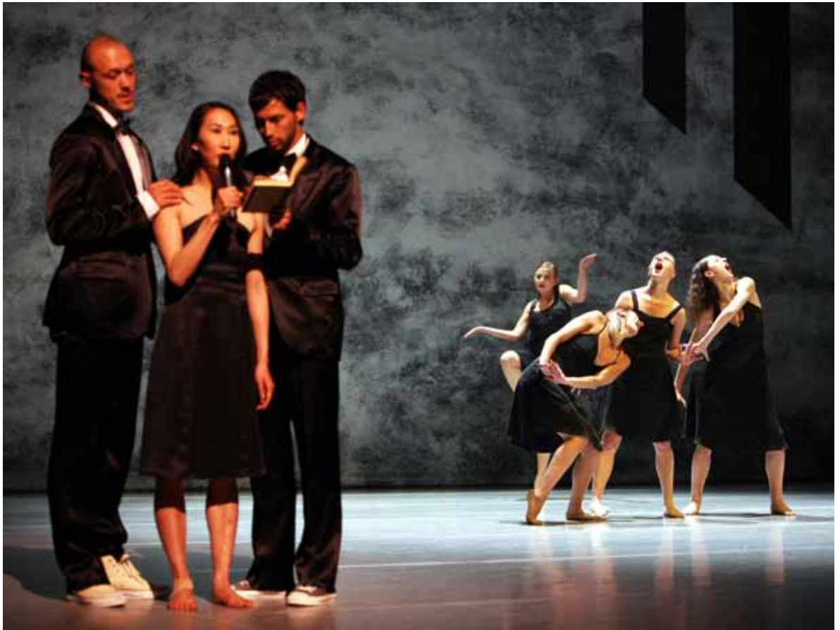
Scapino Ballet Rotterdam in TWOOLS at the Opera.