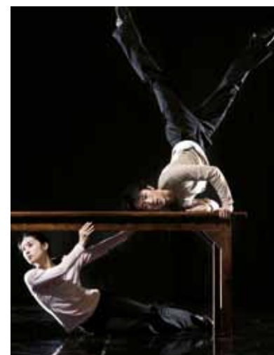
Cloud Gate 2 in Isthmus . Photo: Liu Chen-hsiang