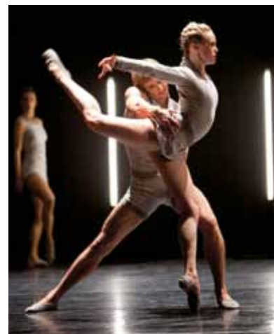
Birmingham Royal Ballet in The Centre and its Opposite .