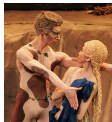
Tokyo Ballet in L'Après-midi d'un faune .