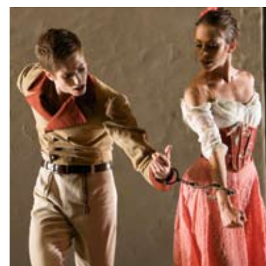
Scottish Ballet - Carmen.