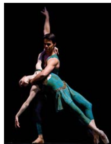
San Francisco Ballet - Within the Golden Hour.