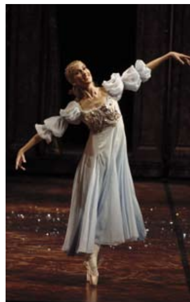
Mikhailovsky Ballet's Romeo and Juliet . Photo: The Mikhailovsky Theatre