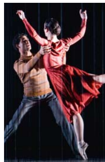
The Royal Ballet in Rushes .